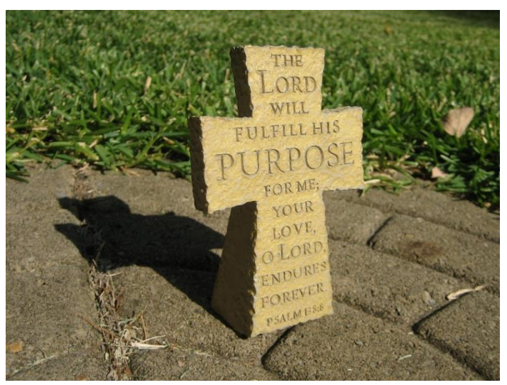
The verse on the pictured cross is in Psalm 138:8-NIV

"We are more than conquerors through Him who loved us" Romans 8:37